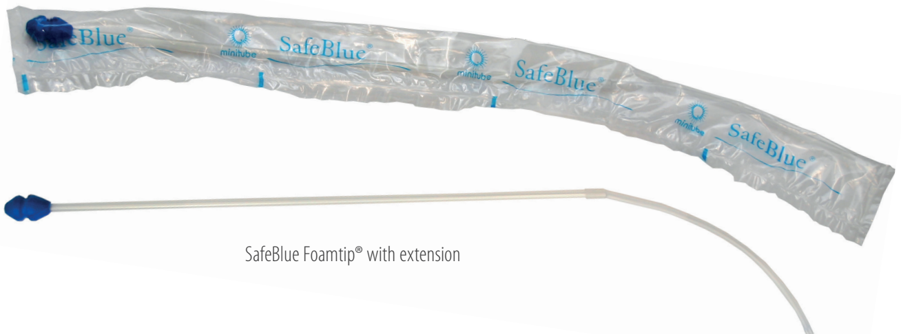
SafeBlue Foamtip® with extension